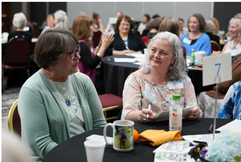
Elders' wives gathered on Sunday morning for an inspiring workshop.

Following Sunday morning breakfast, a workshop for the ministerial wives began the