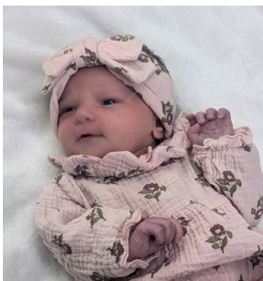
Marion River Rains