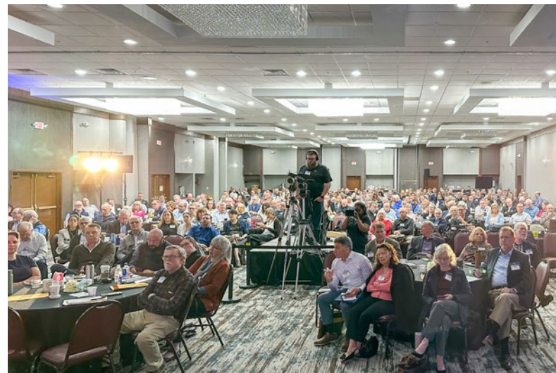
Over 330 elders and wives gathered for a fruitful GCE meeting.