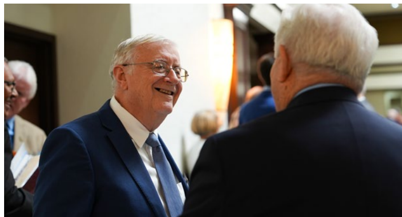
The theme this year was "Enhancing Ministerial Skills."